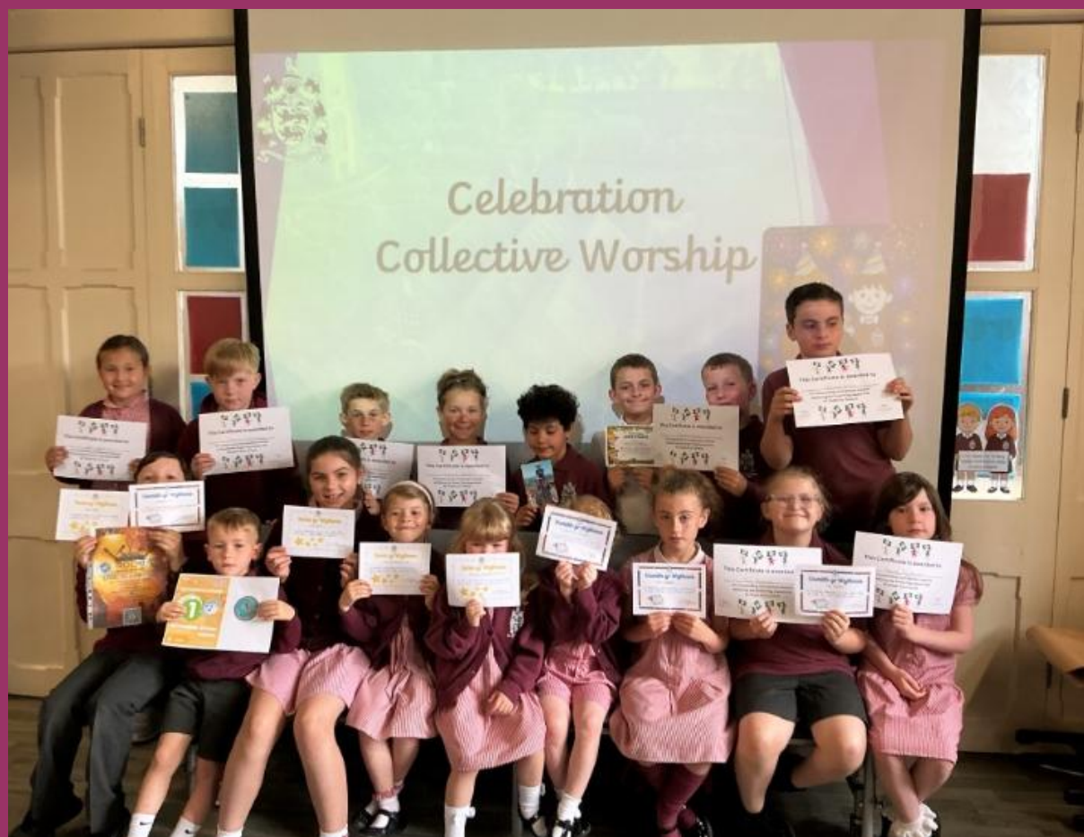
Well done to all our pupils who gained awards this week!

Monday- No forest school Tuesday- No forest school Wednesday- Class 2 and Year 5 Friday- No forest school